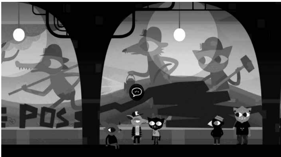
Figure 1. Mae talking with some teens that hang out in the Trolley Tunnel beneath the town; the mural behind them has just recently been defaced

instead relegated to service-level jobs, if they are employed at all.