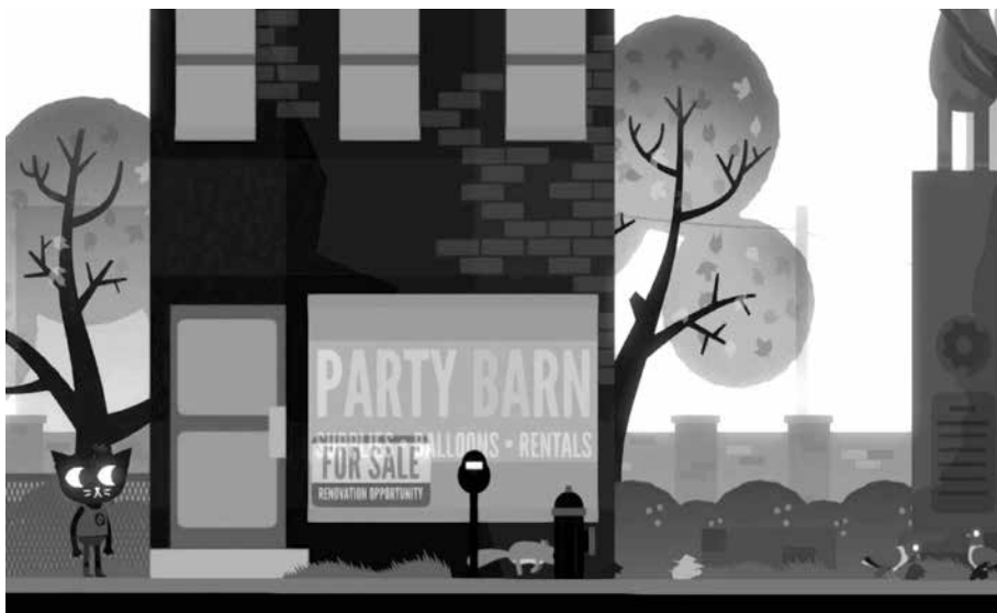
Figure 3. Mae and the closed Party Barn

(31) as demonstrations of how games can make class visible yet fail to provide a useful way to think about class in broader terms.