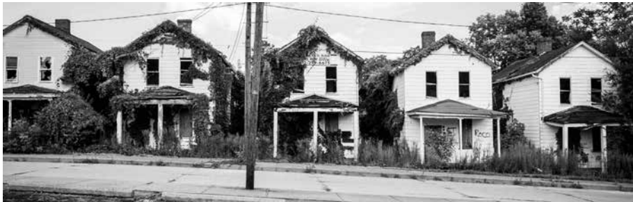
Figure 4. Row houses in Monessen, PA. Cropped image of photograph by Pete Marovich (Newton 2017)