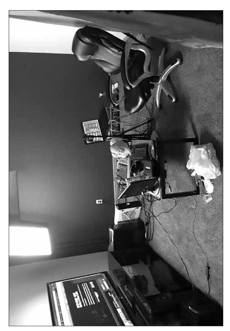
Figure 4. MANvsGame broadcasting room setup posted to Twitter, 2014.

producing particular forms of interaction and community engagement. Performative qualities are connected to wanting to create better content and communities, which for those monetizing their streams, draws and retains viewers. Live streaming is a rich illustration of the assemblage of play, whereby a variety of actors (human and nonhuman), infrastructures, institutions, and interrelations make play, performance, and work possible.