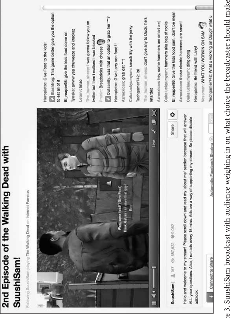
Figure 3. SuushiSam broadcast with audience weighing in on what choice the broadcaster should make, 2012.

ence becomes enlisted in the game play itself by giving input on choices within the game (see figure 3). These moments, especially in tense game scenarios, are particularly entertaining and regularly generate high audience engagement.