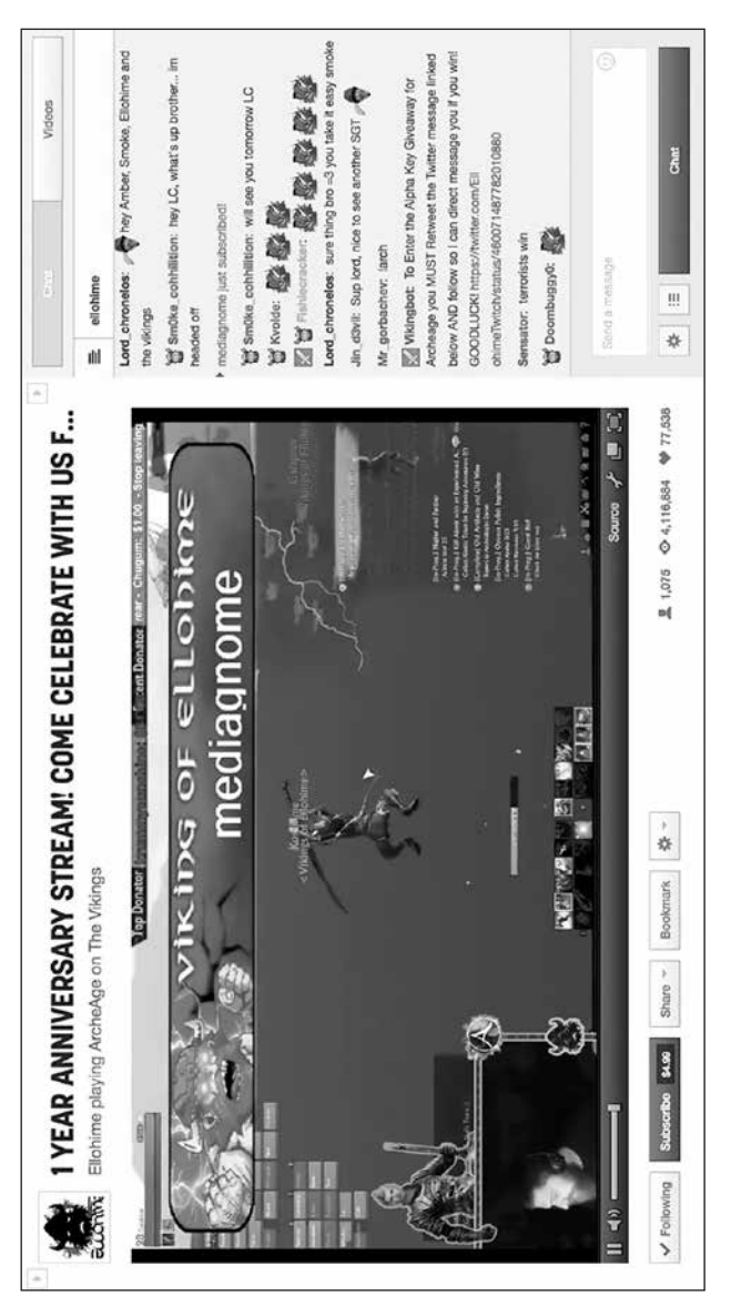
Figure 1. Ellohime broadcast with auto pop-up banner when the channel gets a new follower (dubbed a "Viking of Ellohime"), 2014.

These live stream productions can be broken down into a number of layers.