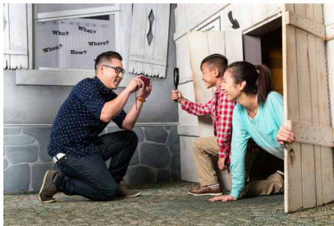
Father Takes Photo of Children in Mystery Mansion

Once I go past the very big arch that looks like a pop-up book, I will be in Reading Adventureland .